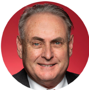
Senator the Hon Don Farrell Minister for Trade & Tourism