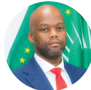
Wamkele Keabetswe Mene Secretary General, African Continental Free Trade Area